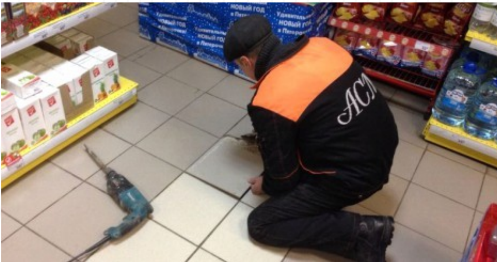
Replacement of floor tiles.