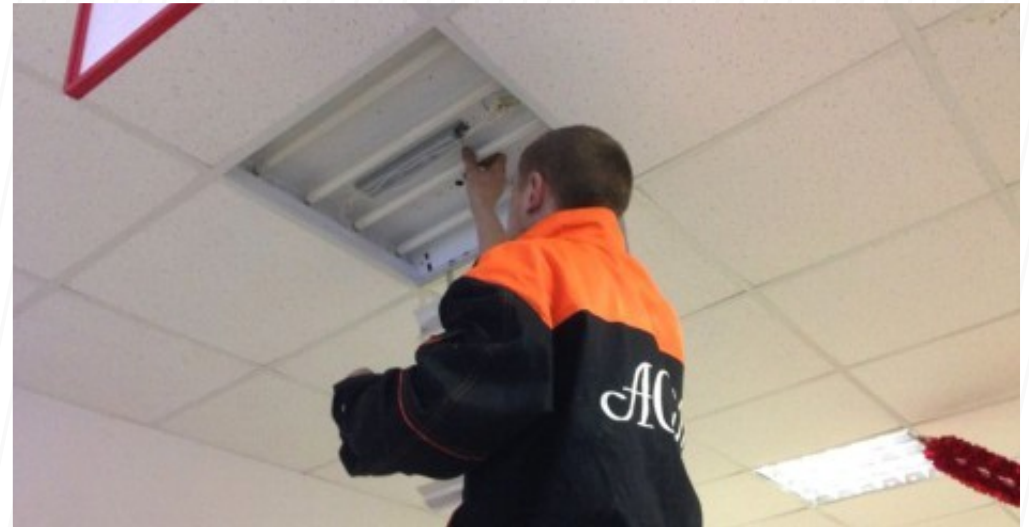
Ensuring 100% lighting