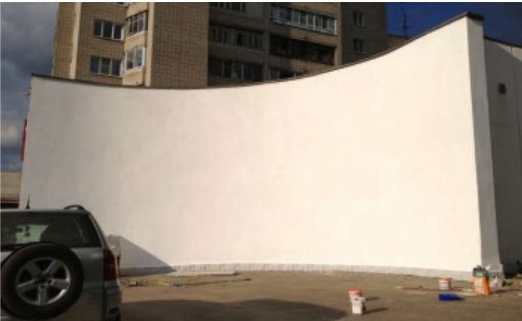
Repair and painting of façade walls.