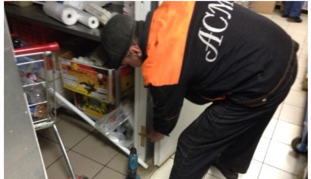
Hinge repair and replacement.