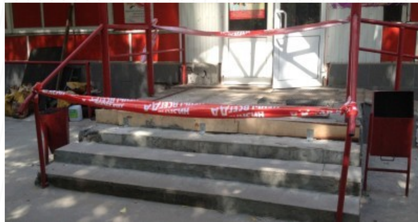
Repair of entrance thresholds.