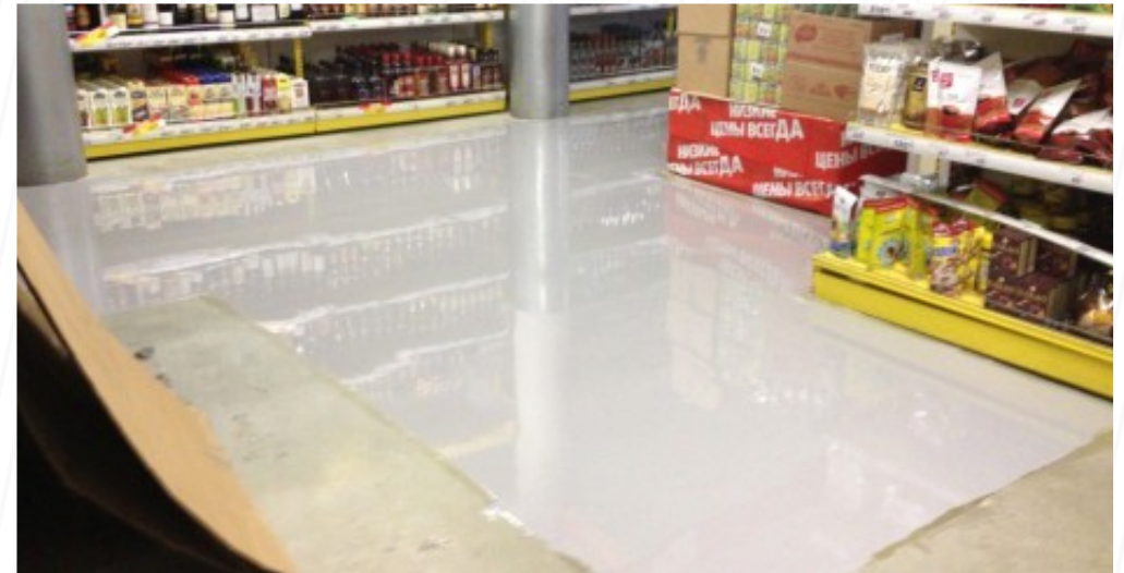
Installation of vinyl floors.